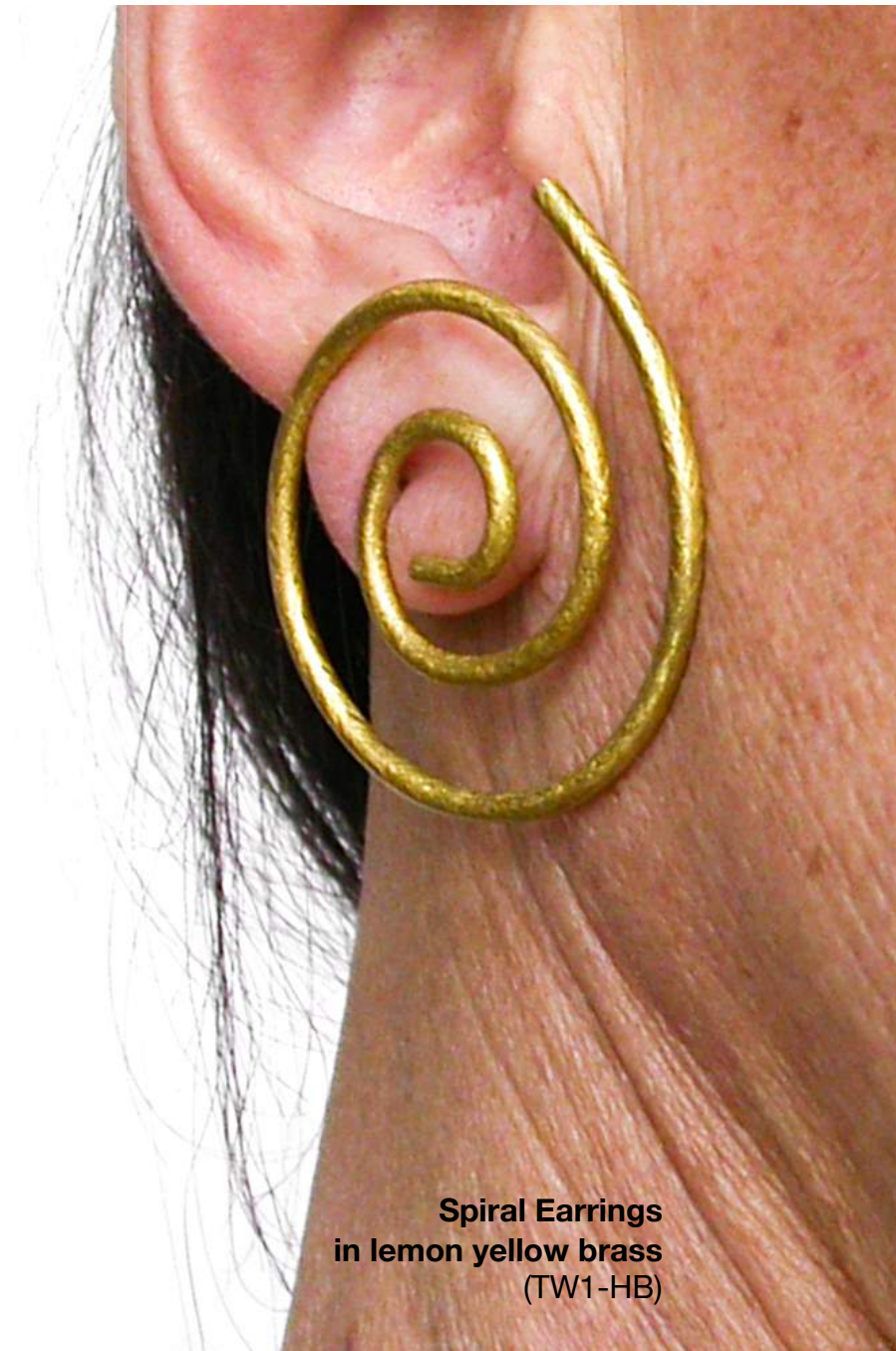
Spiral Earrings in lemon yellow brass (TW1-HB)

emanuela aureli©1990-2023 - small production line